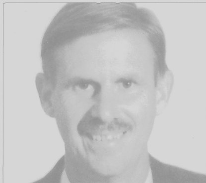
RD Claassen SC

We congratulate them and wish them everything of the best.