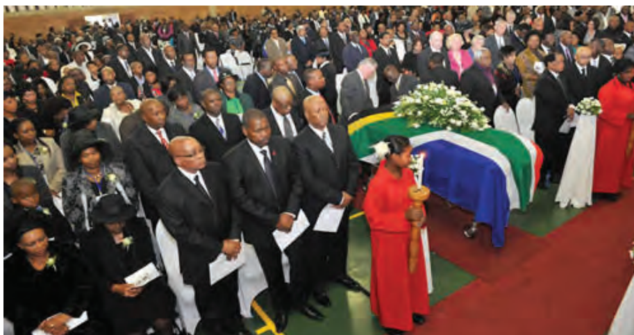
At the funeral of Msimang JP

Deadlines for contributions: December issue: 31 August 2011; April 2012 issue: 31 January 2012